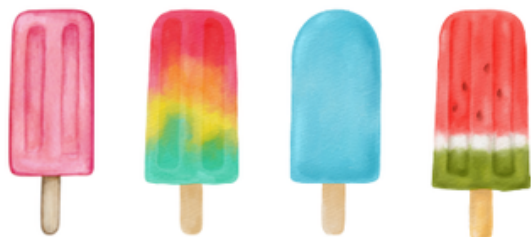
Preschool Popsicles with Parents!